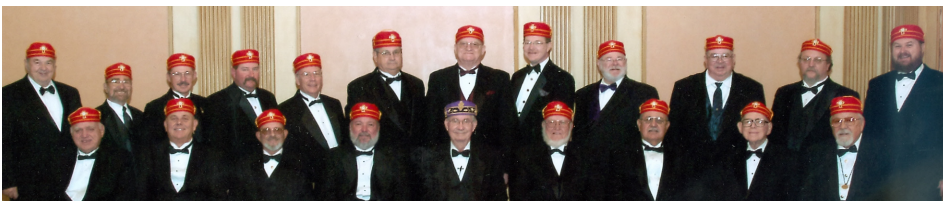
Knight Commander Court of Honour December 9, 2007