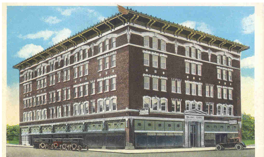
Old Masonic Temple, Enid, Oklahoma

We look forward to seeing many of our Brethren on the road this year!