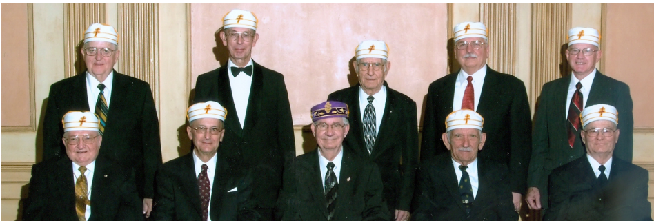
Inspector General Honorary 33° January 12, 2008