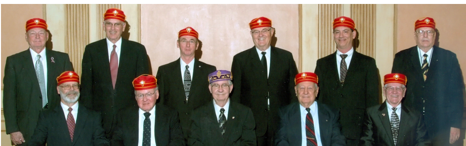
Knight Commander Court of Honour January 12, 2008