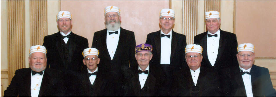
Inspector General Honorary 33° December 9, 2007