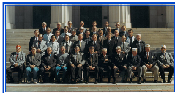
The 2001 Scottish Rite Bicentennial Reunion Class

We look forward to seeing you next month. Please RSVP when you receive your invitation.