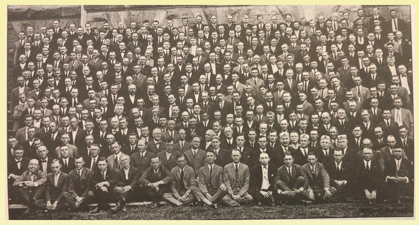
Last class in the old Temple, May 7-10, 1923

in the lodge room were arranged by the workmen Masons and from caps of the huge columns which supported the temple structure. The altar was covered by a marble slab. By the next morning, there were 340 candidates registered in the class.